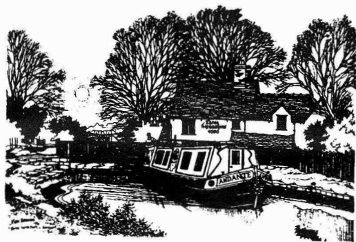
Grand Union Canal - by Alan Bamford

In the 1940's, Britain's waterways were perceived as derelict, dirty ditches. An ever decreasing number of working boats struggled in dreadful conditions to maintain the carrying trade and anyone who navigated canals for pleasure was considered quite eccentric !