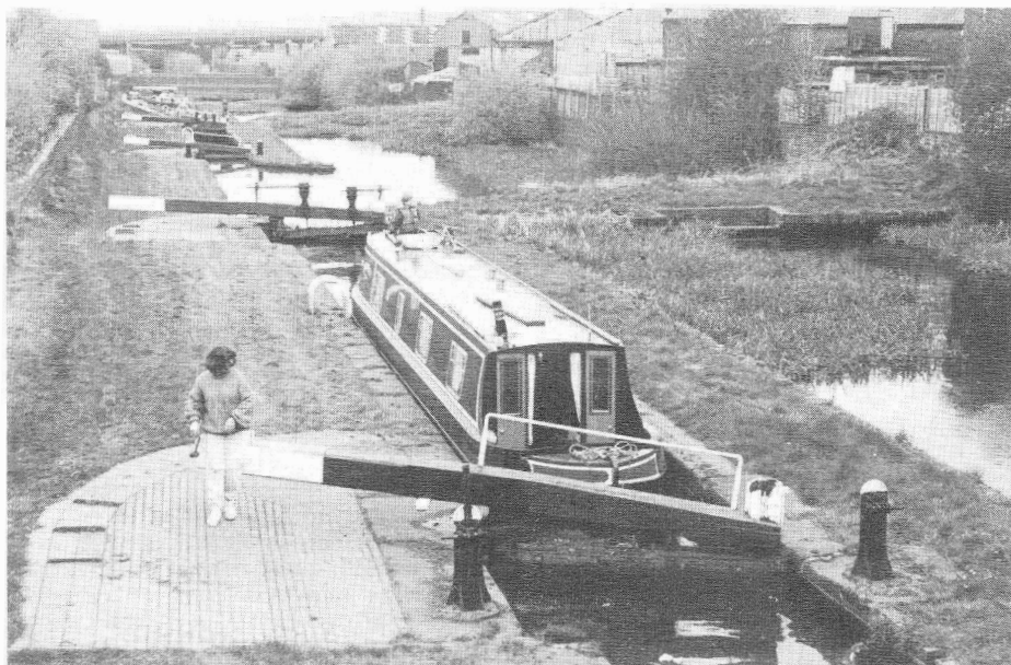
Ascending Oldbury Locks to the summit level of the BCN. A prize contender in the use 'em or lose 'em stakes.